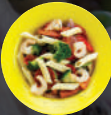
Shrimp Primavera (4pm - close)